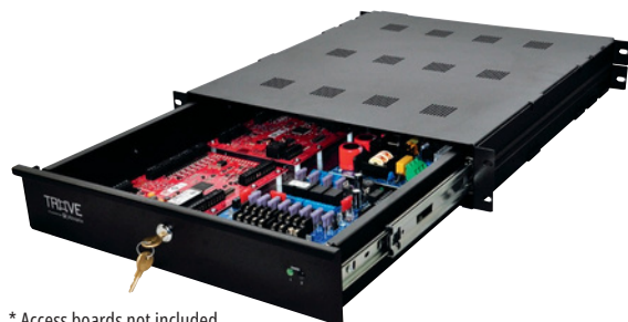
* Access boards not included

AccessNsite, Avigilon, BadgePass, BluBox, Feenics, Genetec, Identocard, IMRON, Johnson Controls, Kastle, Keri Systems, Lenel/S2, LockState, Maxxess, Midpoint Security, NLSS, Open Options, Panasonic Video Insight, Quintron, RS2, Schneider Electric, Vanderbilt