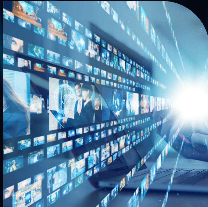
AI Video Analytics