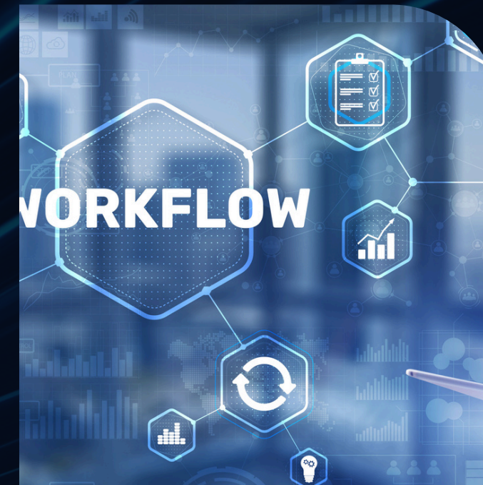
Triggers and Macros