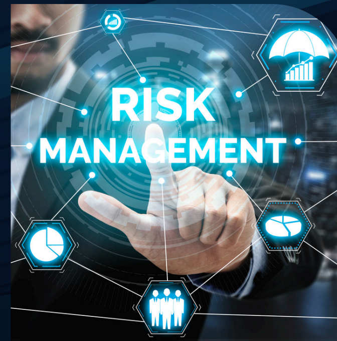
Proactive Risk Reduction